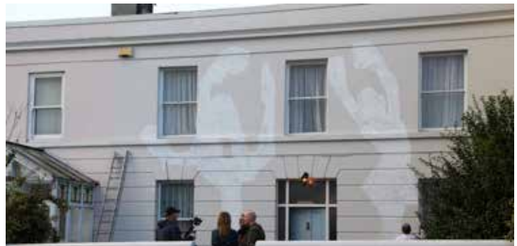
The ghosts of the ballerinas.