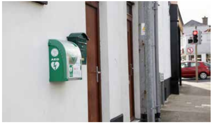
Defibrillator on Link Road

One has been sold for a business, the other as a family residence.