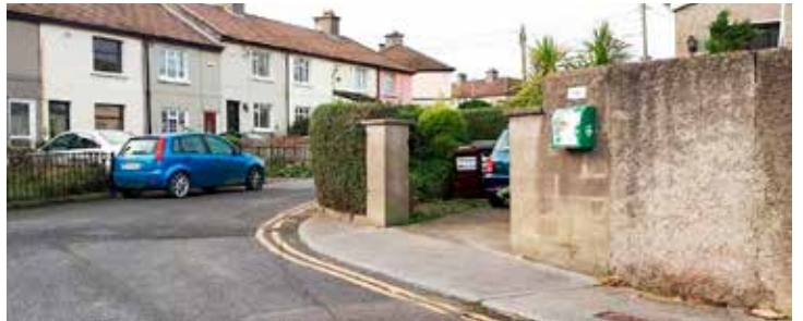
Defibrillator in place in Eden Villas