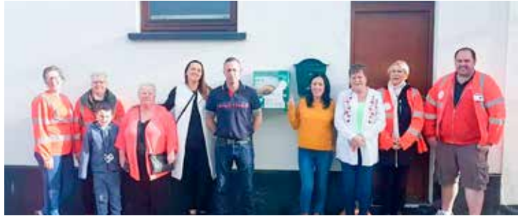
Some of the Costello family with members of the Dalkey Community First Responders on Link Road