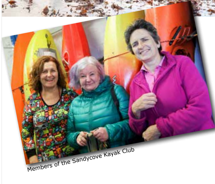
Members of the Sandycove Kayak Club