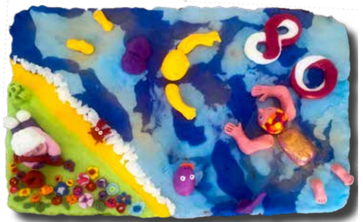
Swimming themed birthday cake