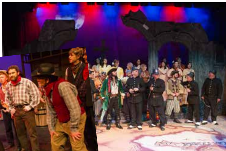
Pirates of Penzance