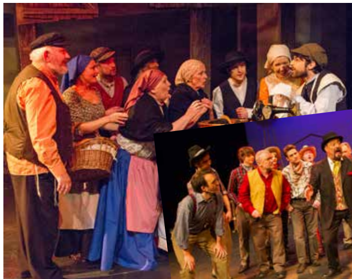
Fiddler on the Roof

They provide local entertainment and an opportunity for the community to see their fellow-citizens (and families) in action. They will perform for 5 nights to a live audience the vast majority of whom will come from the community.