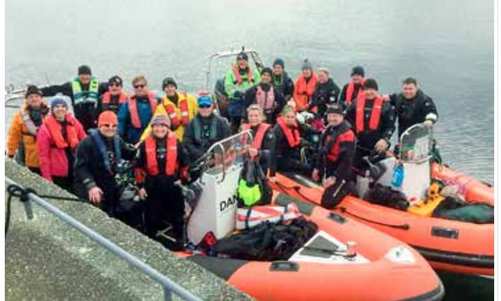
On tour this year in Cork

For more information on the club see www.csac.ie