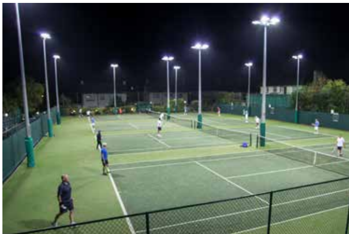
Action on four of the courts

The club was founded in 1886. It has six all weather tennis courts and two squash courts. As well as tennis and squash, the club has a very active social side.