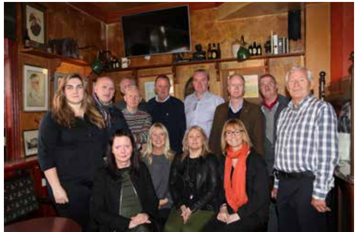
Members of the Local Traders Association