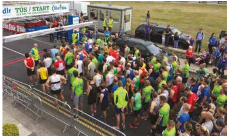
At the start of the dlr Bay 10k