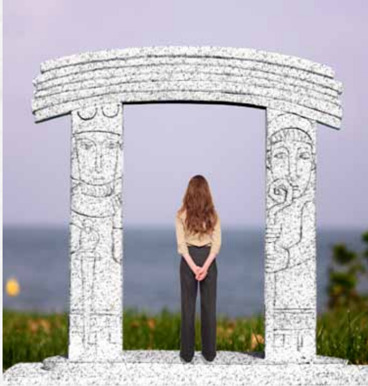
Computer generated image of sculpture