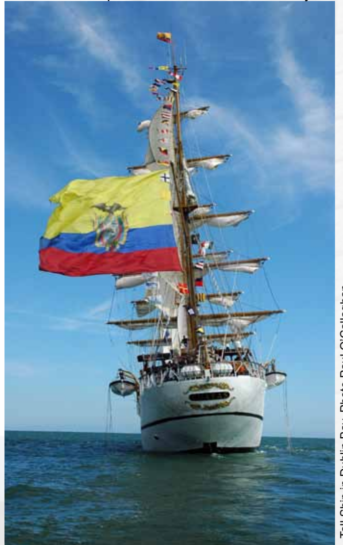
Tall Ship in Dublin Bay

Would it not be preferable to see this in the bay?