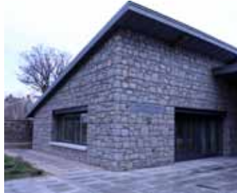
St. Joseph's Pastoral Centre

The two houses to the left of St. Joseph's Church in Glashule have been sold. This reduces the church debt to €1.7m.