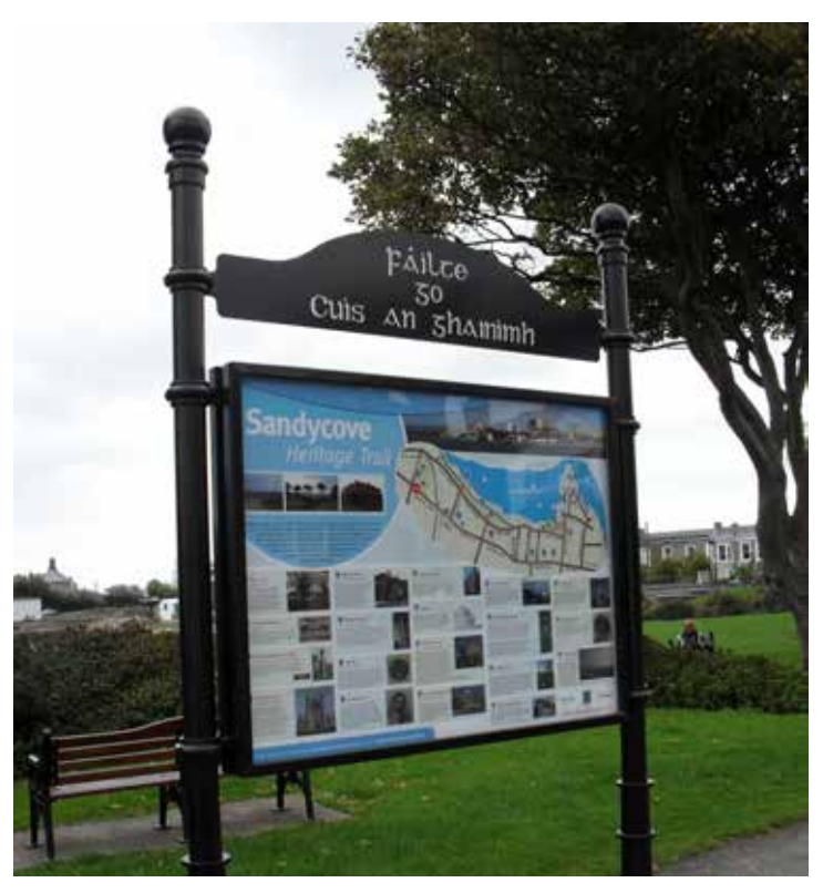
New sign at Otranta Place with information on "Sandycove Heritage Trail" and local wildlife (on reverse side).

Well done on offering a piece of your inspiring sculpture for when the "New Garden" is complete.