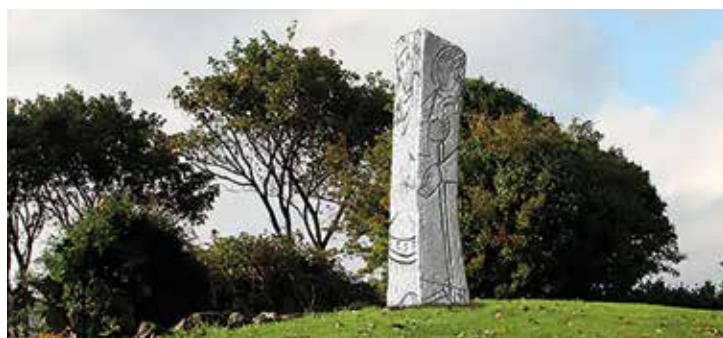
Computer composed image of proposed sculpture in location

The funding, completion and installation of the sculpture must be organised wholly by voluntary efforts and we are looking for both local residents and people from outside the area who know of Imogen's work and would be interested in getting involved in this exciting project. While the design of the sculpture is being donated by Imogen, funds must be raised for the materials and labour to bring this project to fruition. A special organising committee is to be formed for this project, which it is hoped can be completed in the coming year. All those who wish to express an interest are asked to contact any committee member or email info@sandycoveandglashule.ie no later than Friday, 15 June.