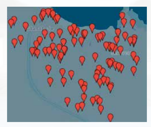
Map of the area showing distribution of a sample of association members