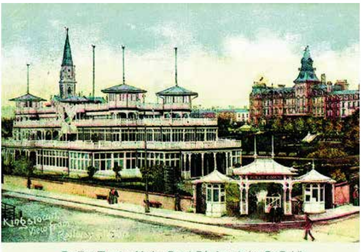
Pavilion Theatre, Marine Road, Dún Laoghaire, Co Dublin

Pavilion Theatre has been a significant part of our Dún Laoghaire landscape for over a century, first opening its doors in 1903. Those 111 years have seen three very different buildings, three very different Pavilions, all with their own histories, stories and secrets.