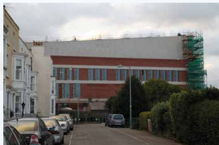
Watch the sun go down!