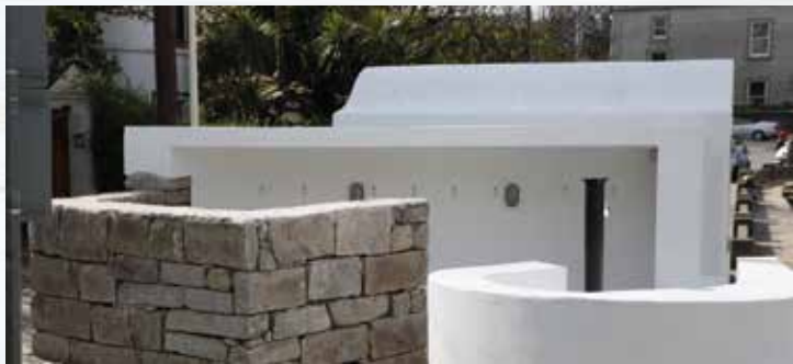
The new changing area and shower beside Sandy Cove beach.