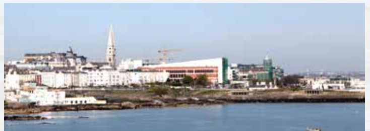
Dun Laoghaire as seen from the top of the James Joyce Tower