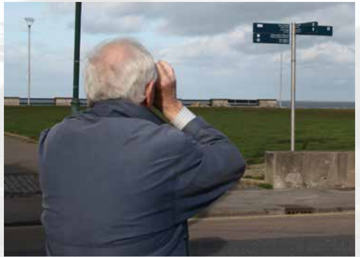
Binoculars might be needed to see the writing on these signs!