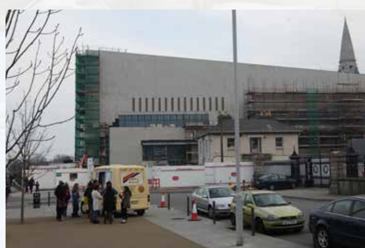
Watch the sun rise!