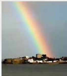
Not a pot of gold