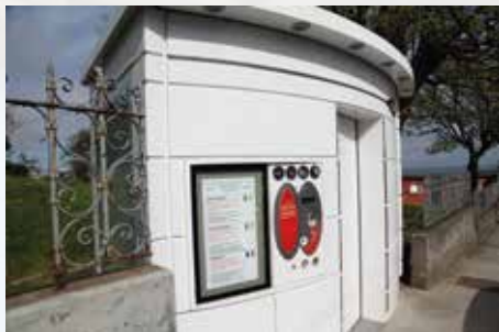
The only place to go?