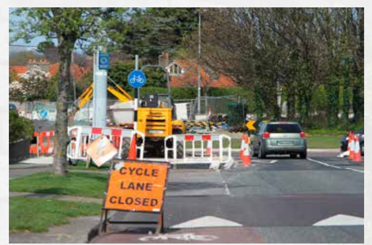
The €472,000 Roundabout. Were the residents of Sandycove, Glasthule, Glenageary, Dalkey and Killiney right all along?