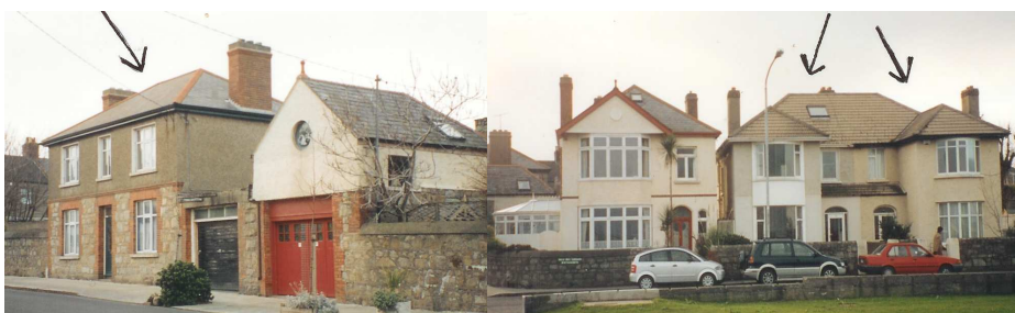
Link Road and Newtownsmith — our village is under threat from developers. These perfectly good houses to be replaced by 18 apartments?