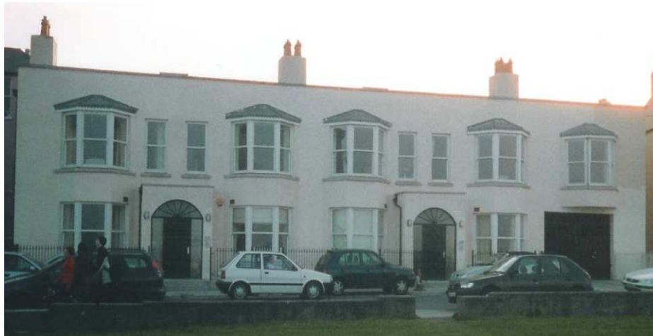
Sandycove House at Newtownsmith – an improvement on what was there before and what might have been, due at least in part to the efforts of local residents to influence the planning process.