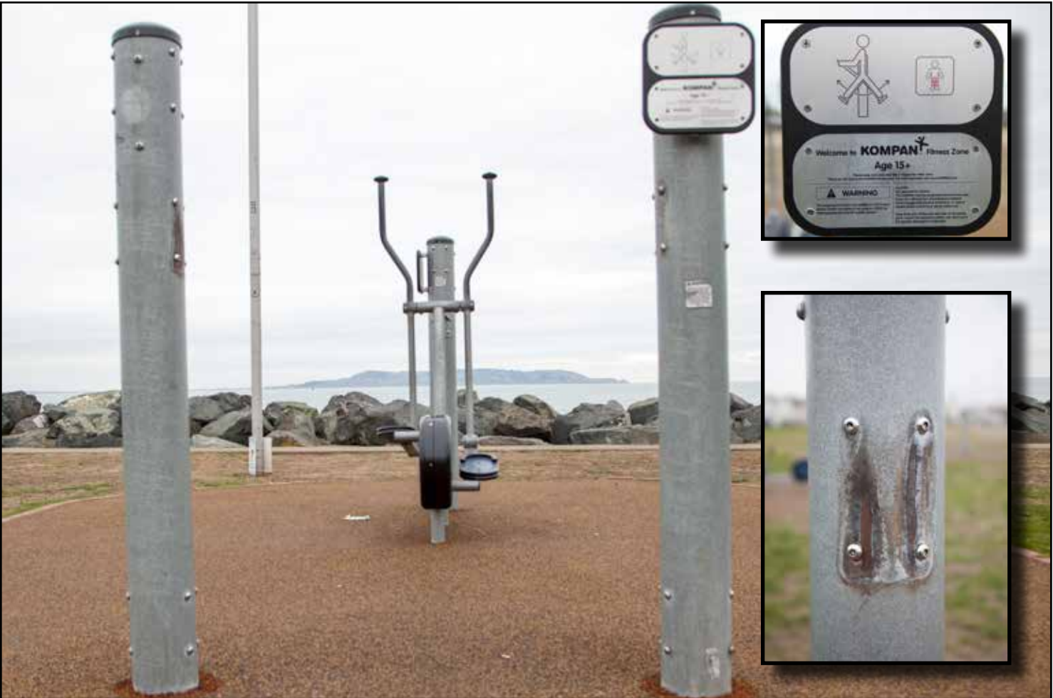
Vandalised outdoor gym equipment in foreground

In light of recent development regarding the outdoor gym we have sent the letter below to the Senior Executive Parks Superintendent.