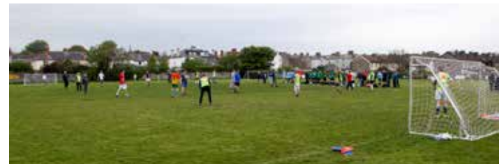
A fundraising match in Pres Field

www.gofundme.com/help-to-save-a-life-larry-costello