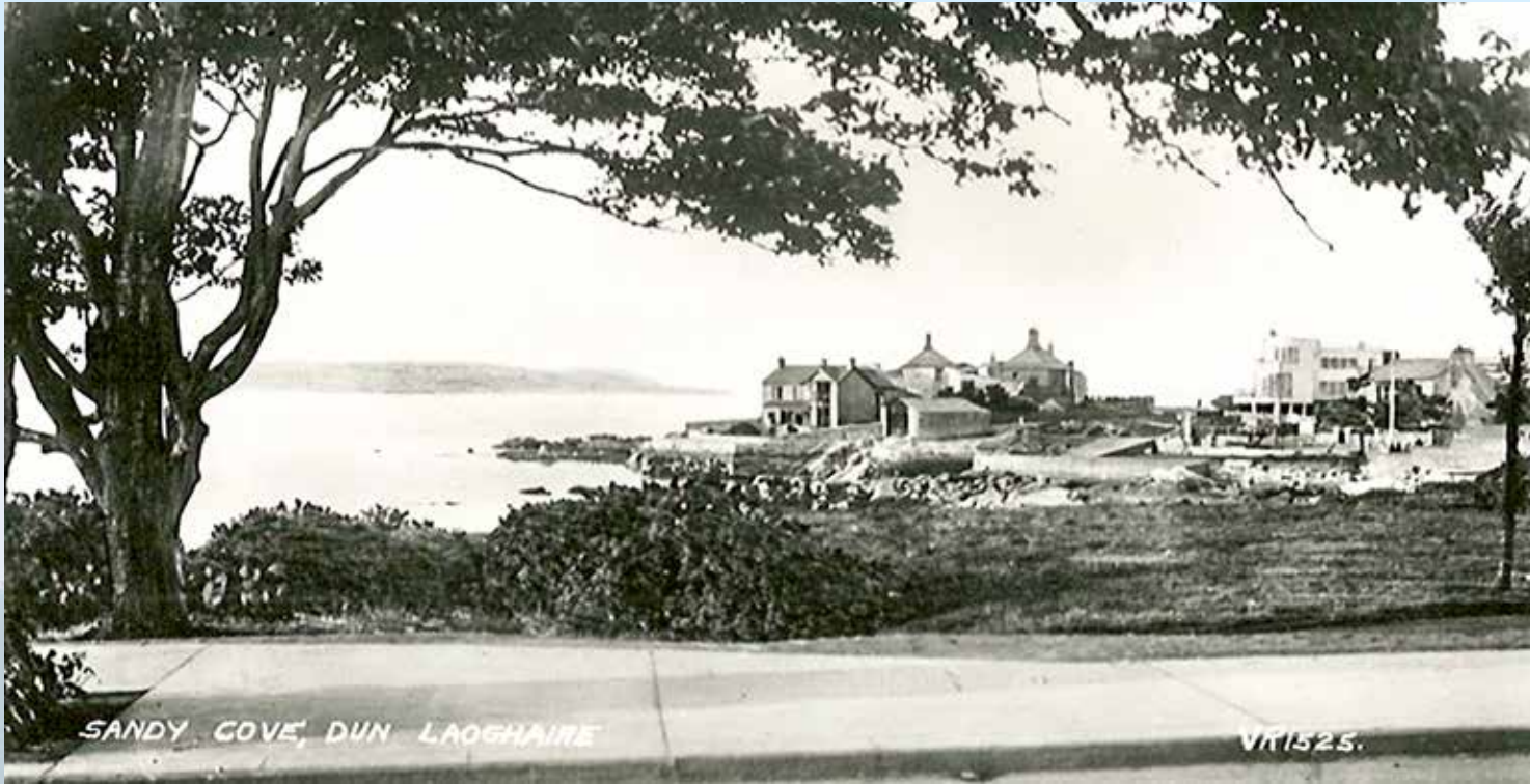
View over Otranto Park from the 40s

Last year plans were drawn up by DLRCC to upgrade and alter the park. While the committee of the residents association welcomes proposals to upgrade and enhance the park, it has concerns about some details of the design. Recently a letter outlining these concerns was sent to both