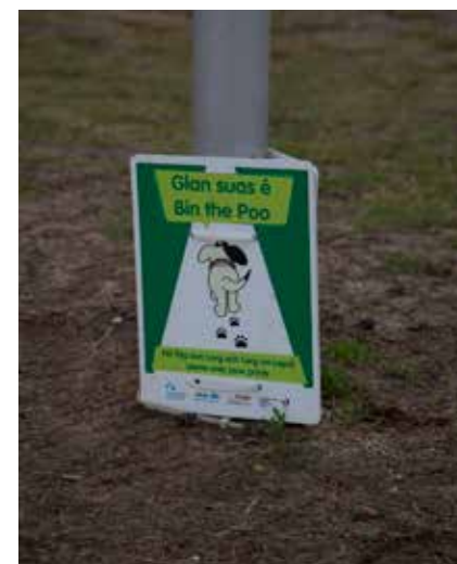
At a perfect height for bilingual dogs