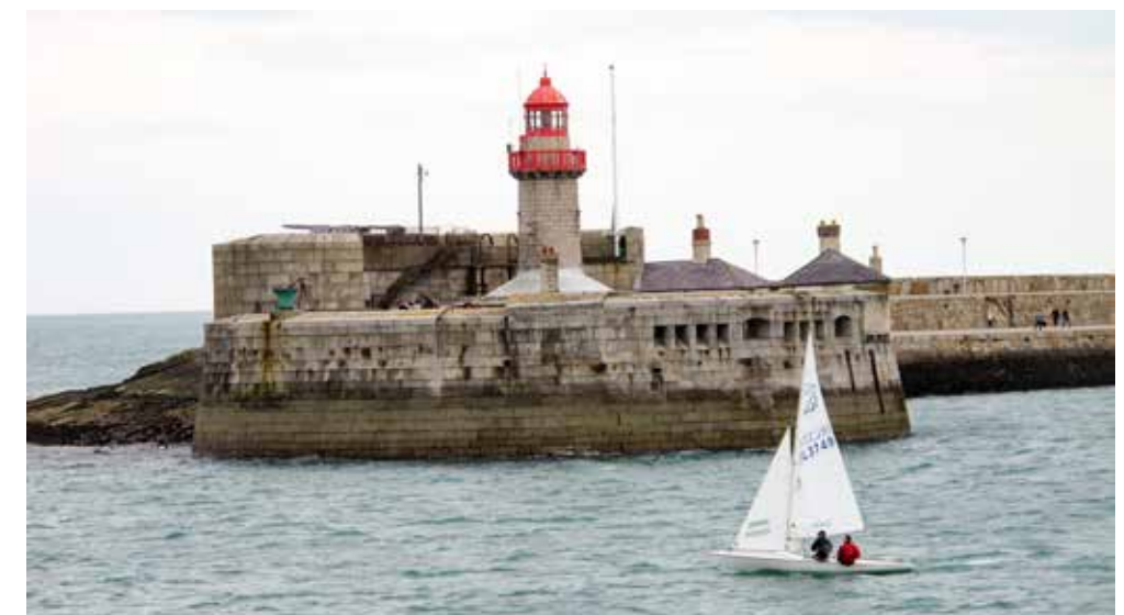
The East Pier from the West Pier - Nearly 200 years old

relaxed environment. Only a few weeks ago, the Youth Alpha retreat day was held in St Joseph's Parish Pastoral Centre. The teens even managed to take in a walk along the seafront during their visit.